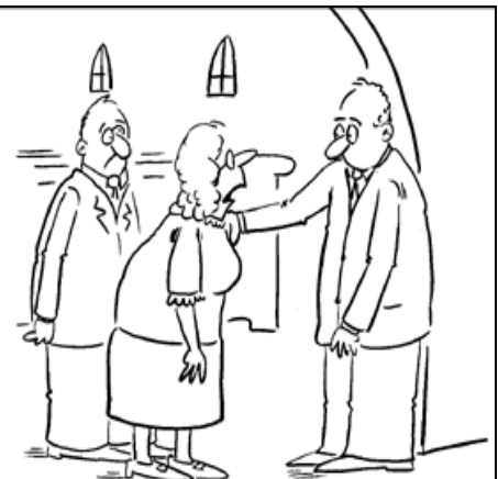
"I work for a non-profit. How do I apply for a tithe-exempt status?"

Call the church office at 703-858-9254 if your special date is missing from the birthday/anniversary lists.