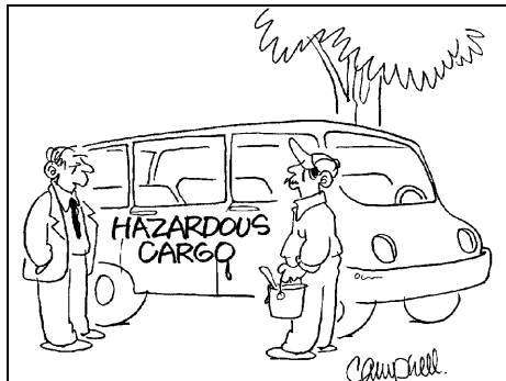
"Technically, you're correct, but it should say 'First Church Youth Van.'"