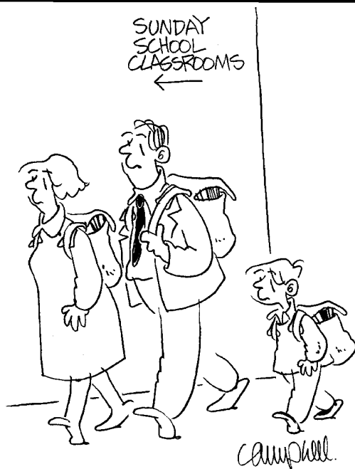
"Whatever happened to the Bible being sufficient?"

Each year the subtle seasonal changes remind us of how universal change really is—and that includes the way congregations carry out their work. Your investment in LCEF enables the unique service called Strategic Ministry Planning —a great process by which many congregations focus on Great Commission ministry. Call the SED office at 1-800-637-5723 ext. 212 for more information.