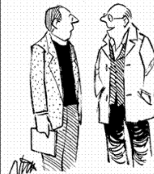
It's like a tithe - I just keep 90% of my commandments.